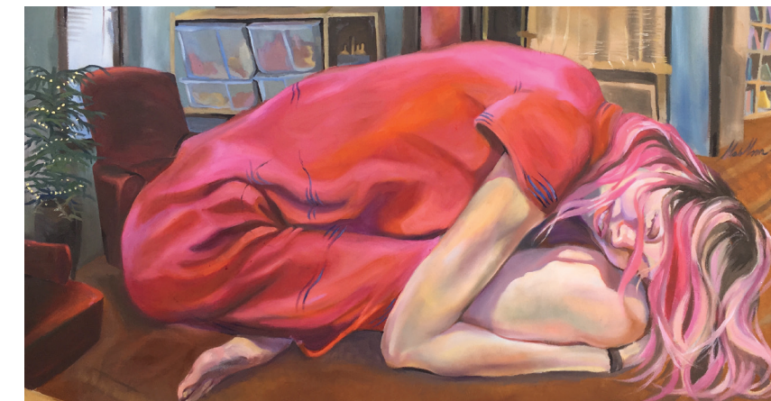
Mab Moon '21

From the day you enter classes, opportunities to exhibit your work within and beyond our community will be at your fingertips. Whether it's a show in the alumni-run curio. Gallery next door, vending at one of our student art markets, as a gallery intern for one of our student-focused galleries, or somewhere new! Each fall, senior fine art majors exhibit their newest finished work in an off-campus exhibition open to the public. In the spring,