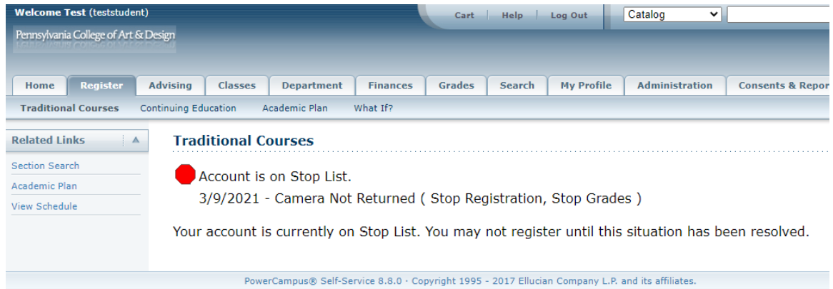
Fig. 2 Depending on the message, check with the Registrar, Business Office, or Library.