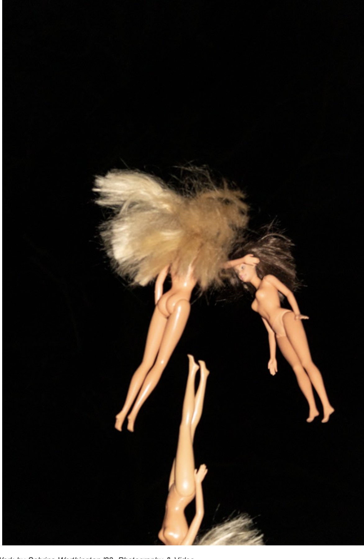
Work by Sabrina Worthington '23, Photography & Video