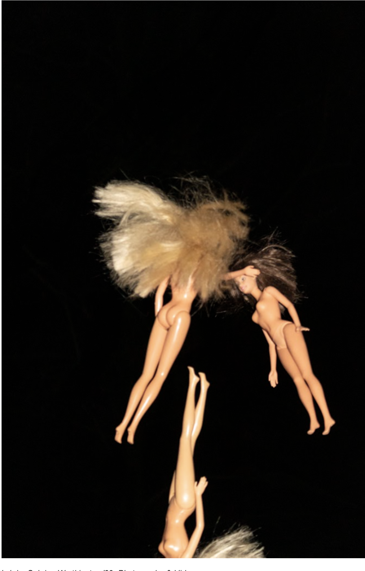
Work by Sabrina Worthington '23, Photography & Video