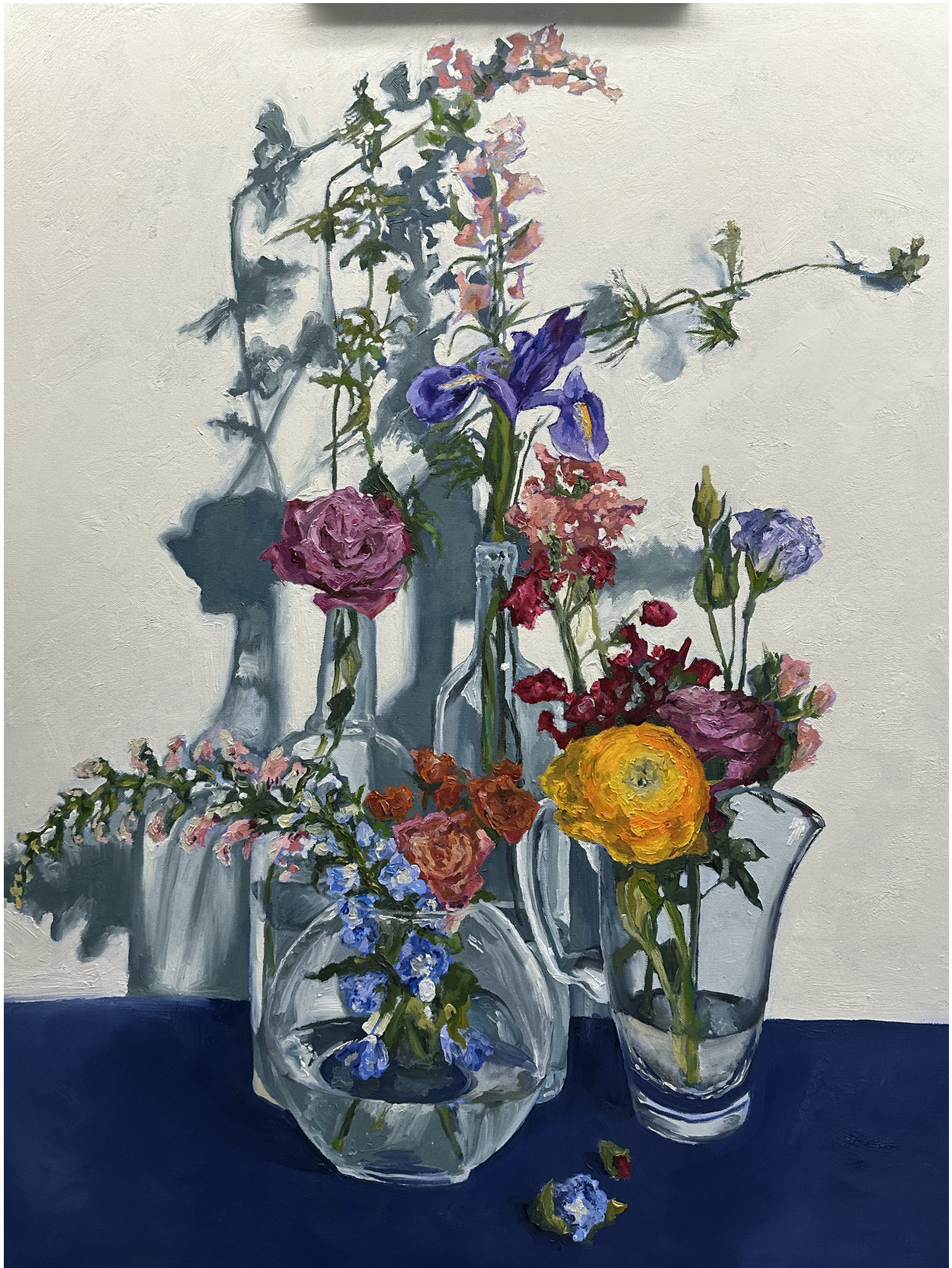
Work by Quinn Knepper '26, Fine Art.