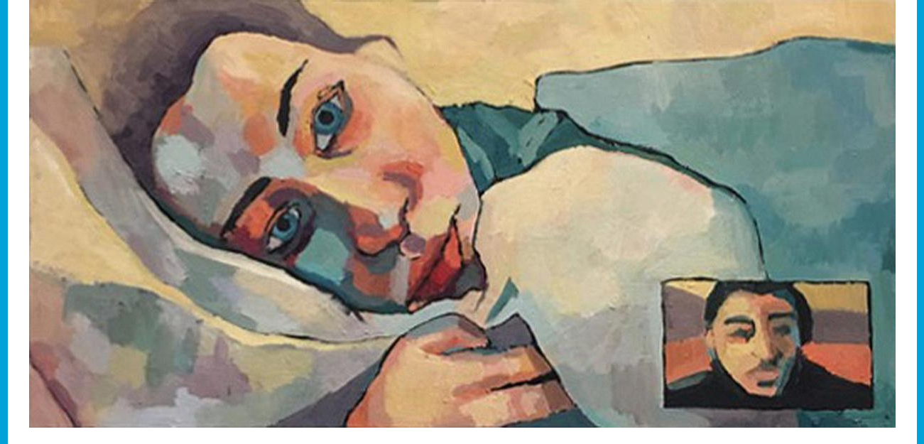
"Face Time," by Rachel Yinger '14, Fine Art.