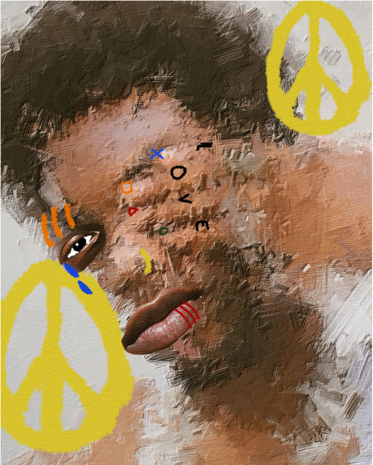
Work by Cameren White '24, Photography & Video.