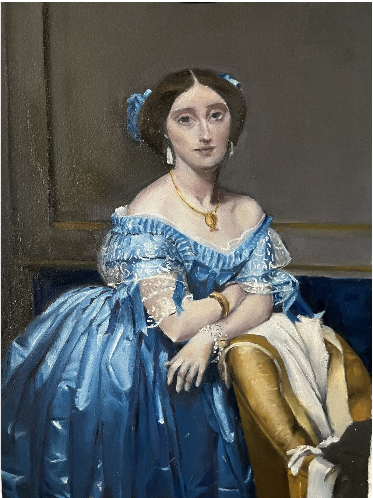
Work by Kelly DeFlavia '27, Fine Art.