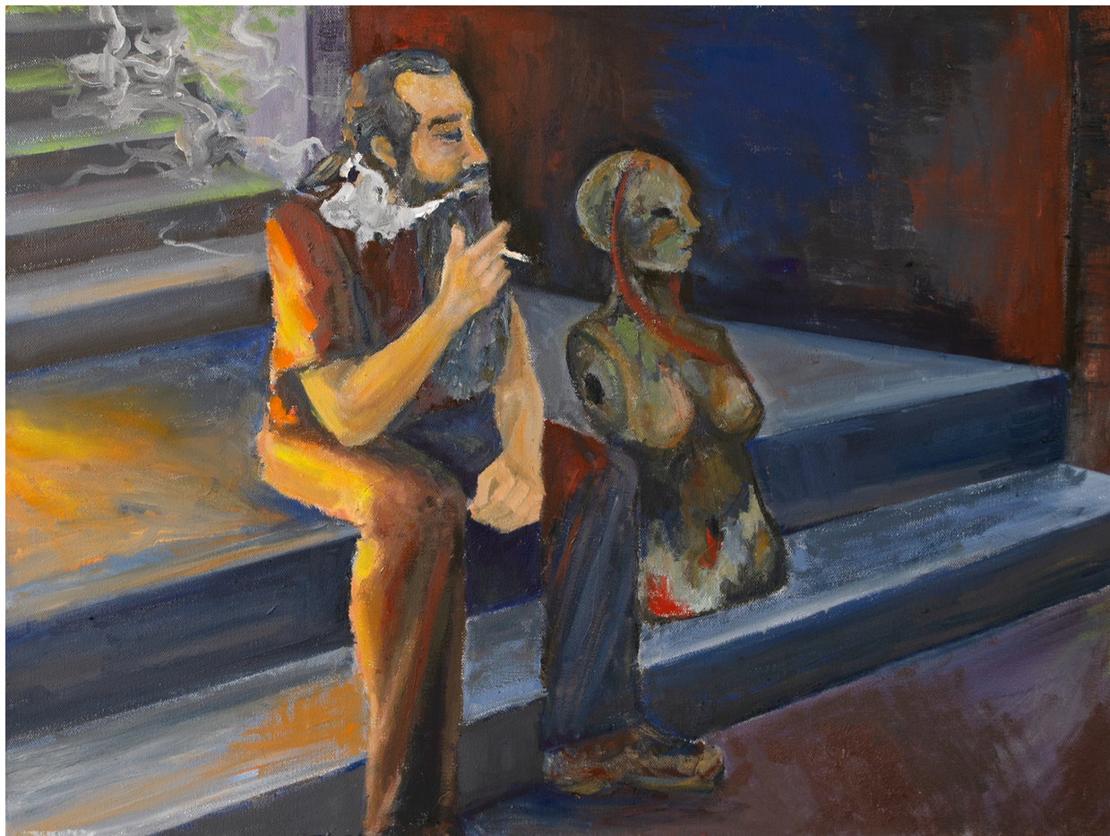
Work by Lexus Schack '26, Fine Art.