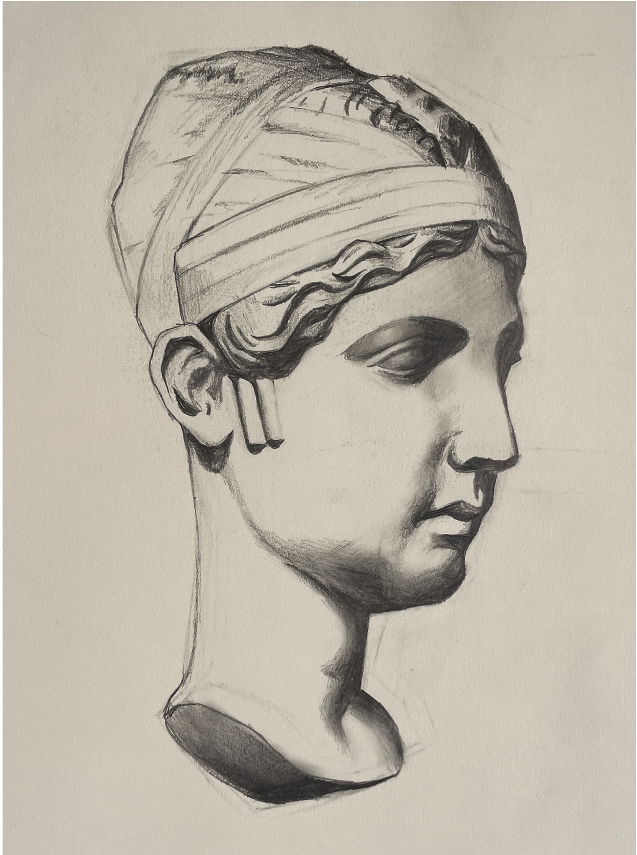
Work by Trinity Young '27, Fine Art.