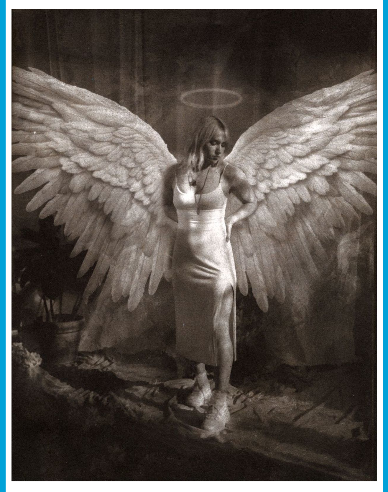
Work by Kiri Chhun '26, Photography & Video.