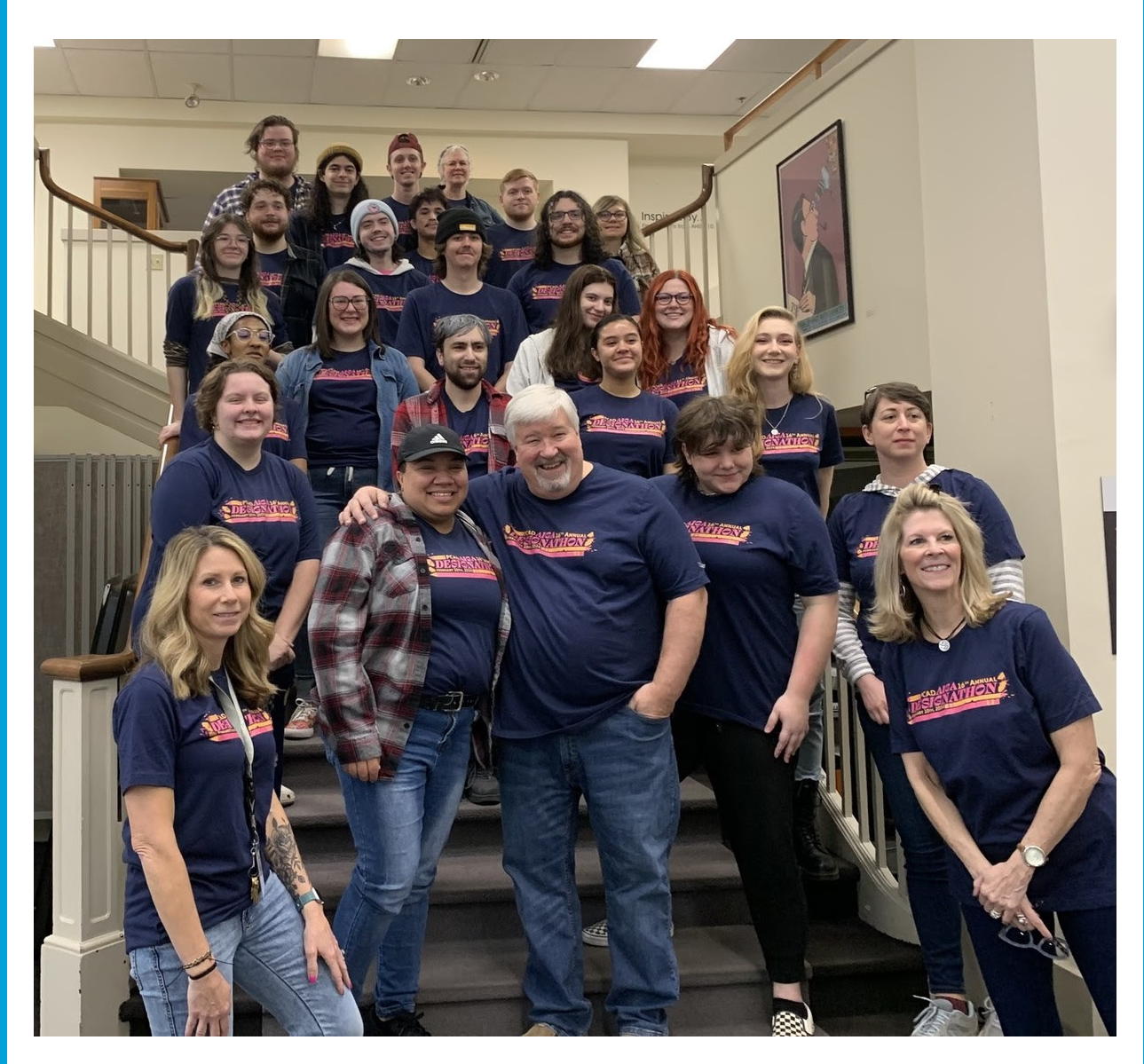
The crew of Desginathon '24 ... join us this year for 12 hours of fun service to community non-profits.

An Opening Reception for the exhibition will take place on Feb. 7 as part of First Friday celebrations.