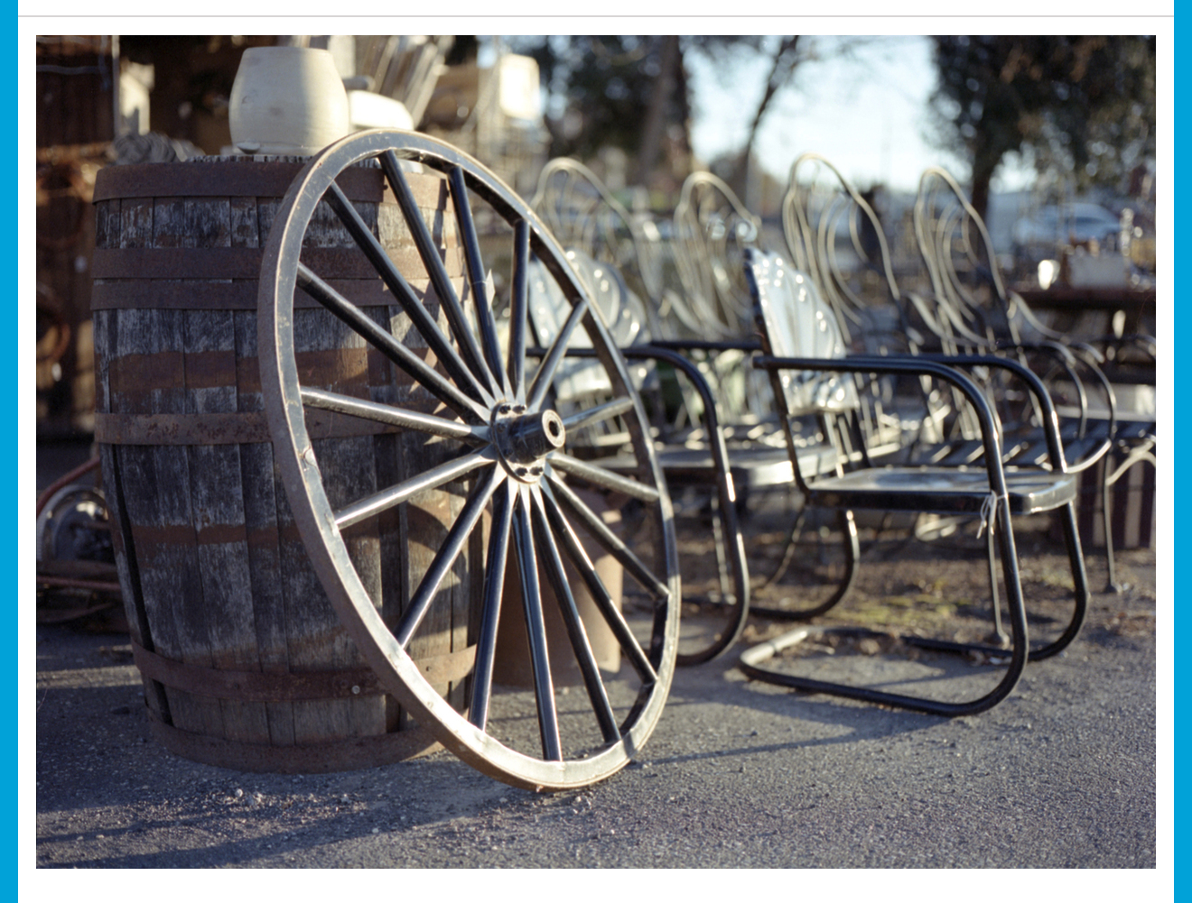
Work by Kaylyn Cuff '28, Photography & Video.