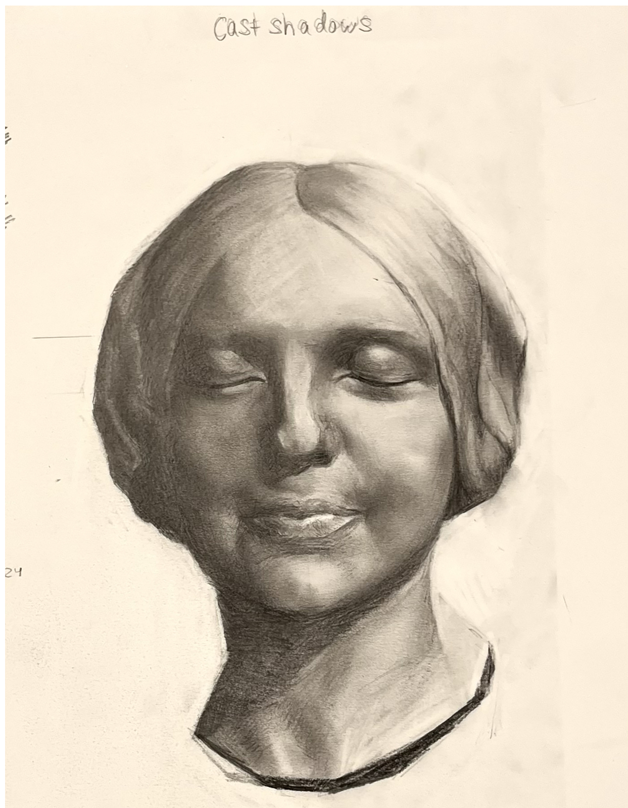
Work by Kelly DeFlavia '27, Fine Art.