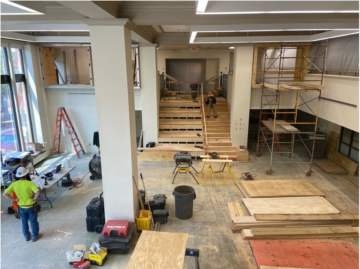
Construction continued last week in the College Atrium -- can't wait to see the finished renovations in time for students' return in August.

For updates and more information, go here .