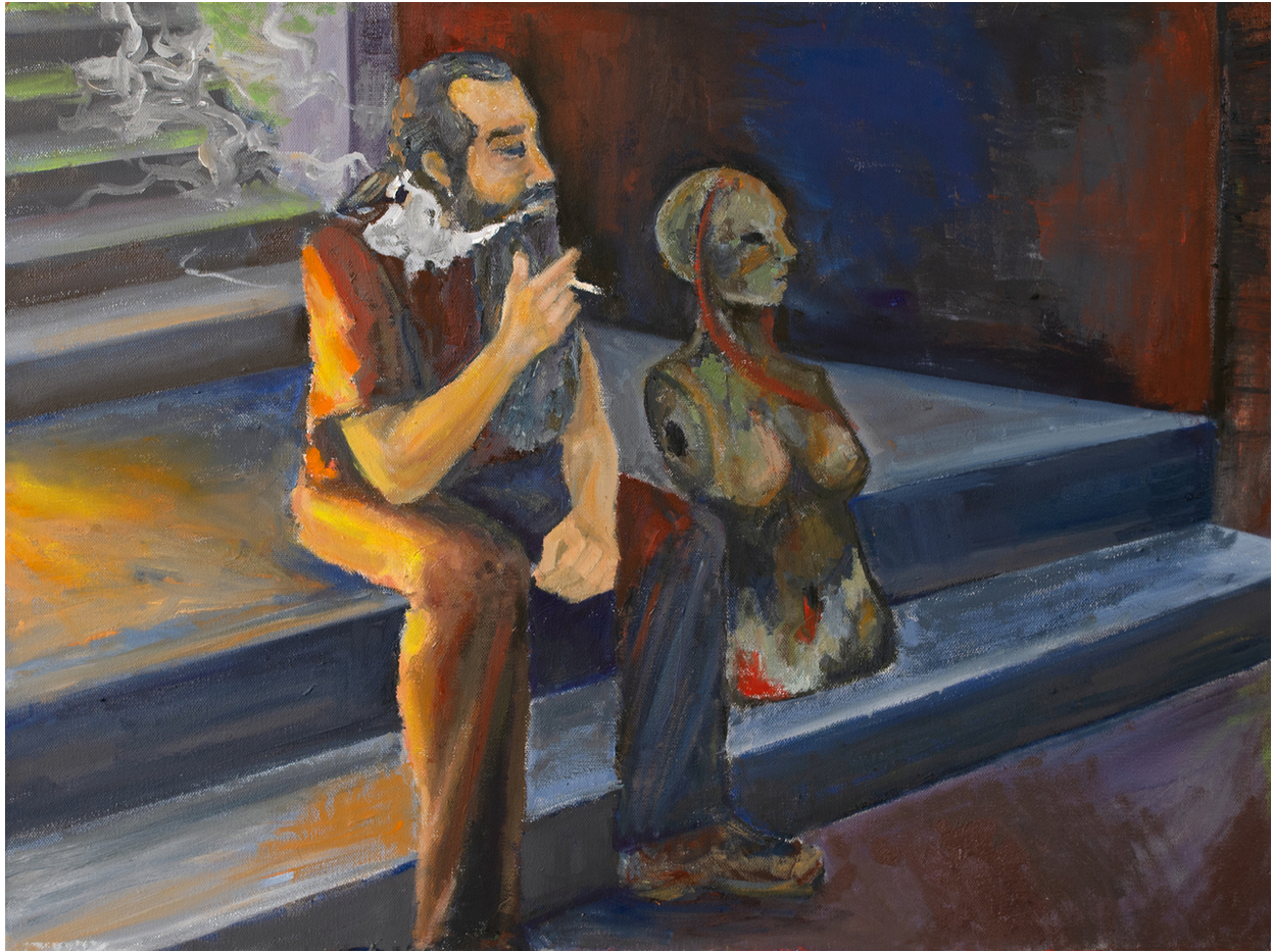
Work by Lexus Schack '26, Fine Art.