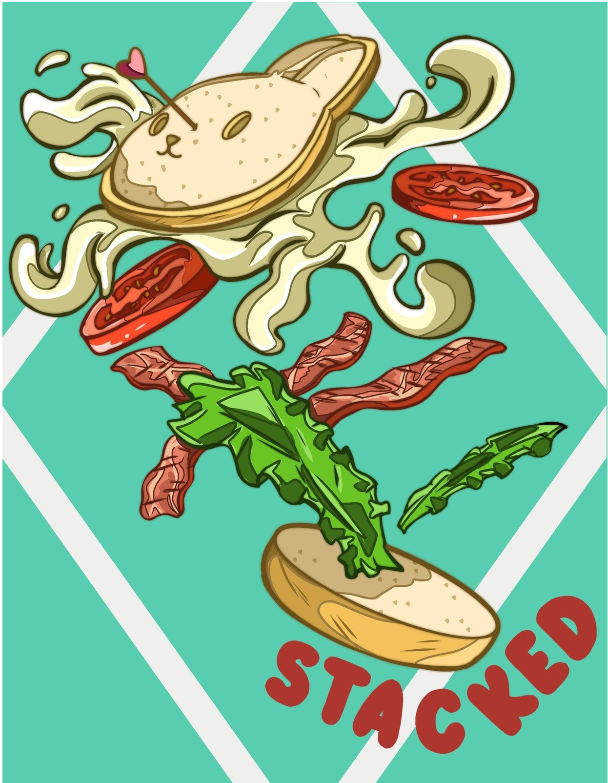
Work by Blake Sipe '24, Illustration.