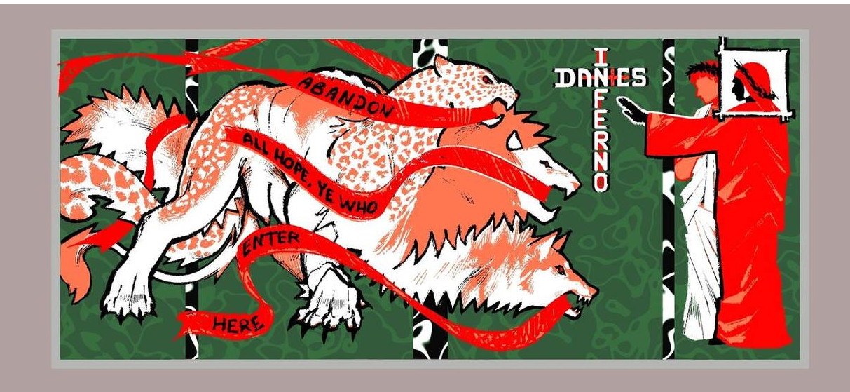
Work by Abby Doyle '25, Illustration.