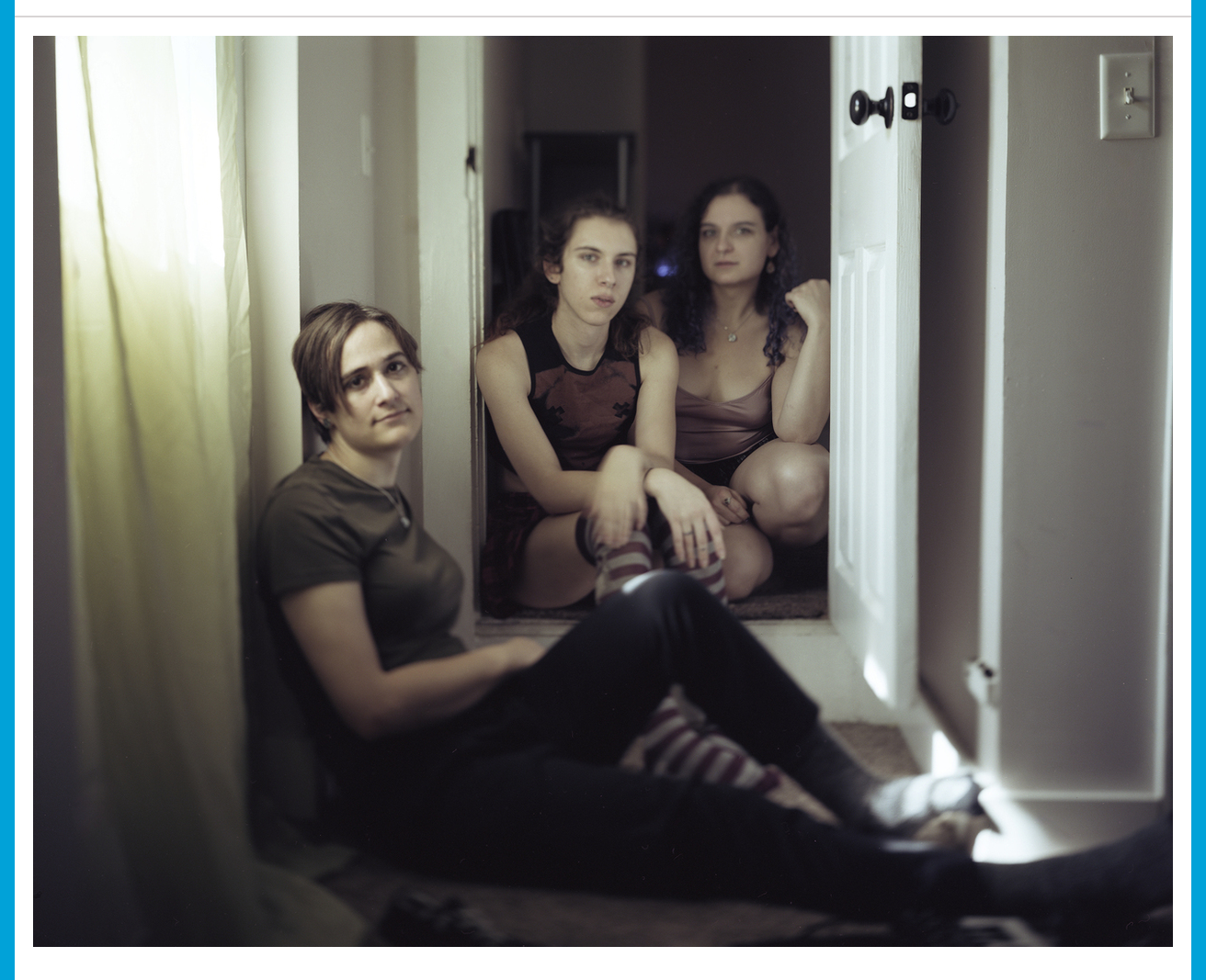
Work by Joshua Hummel '26 Photography & Video.