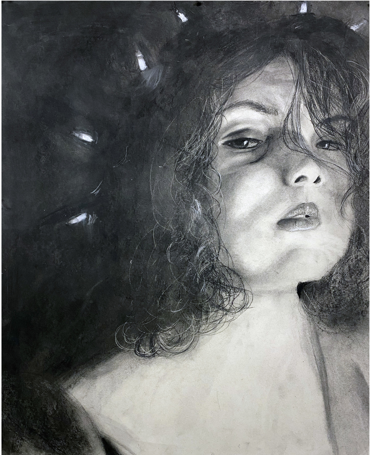
Work by Carina Escobar '27, Illustration.