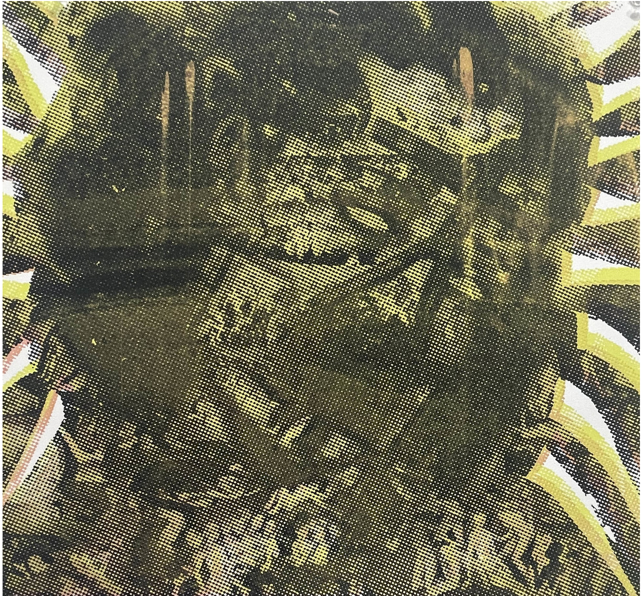
Work by Moon Toomey '27, Fine Art.