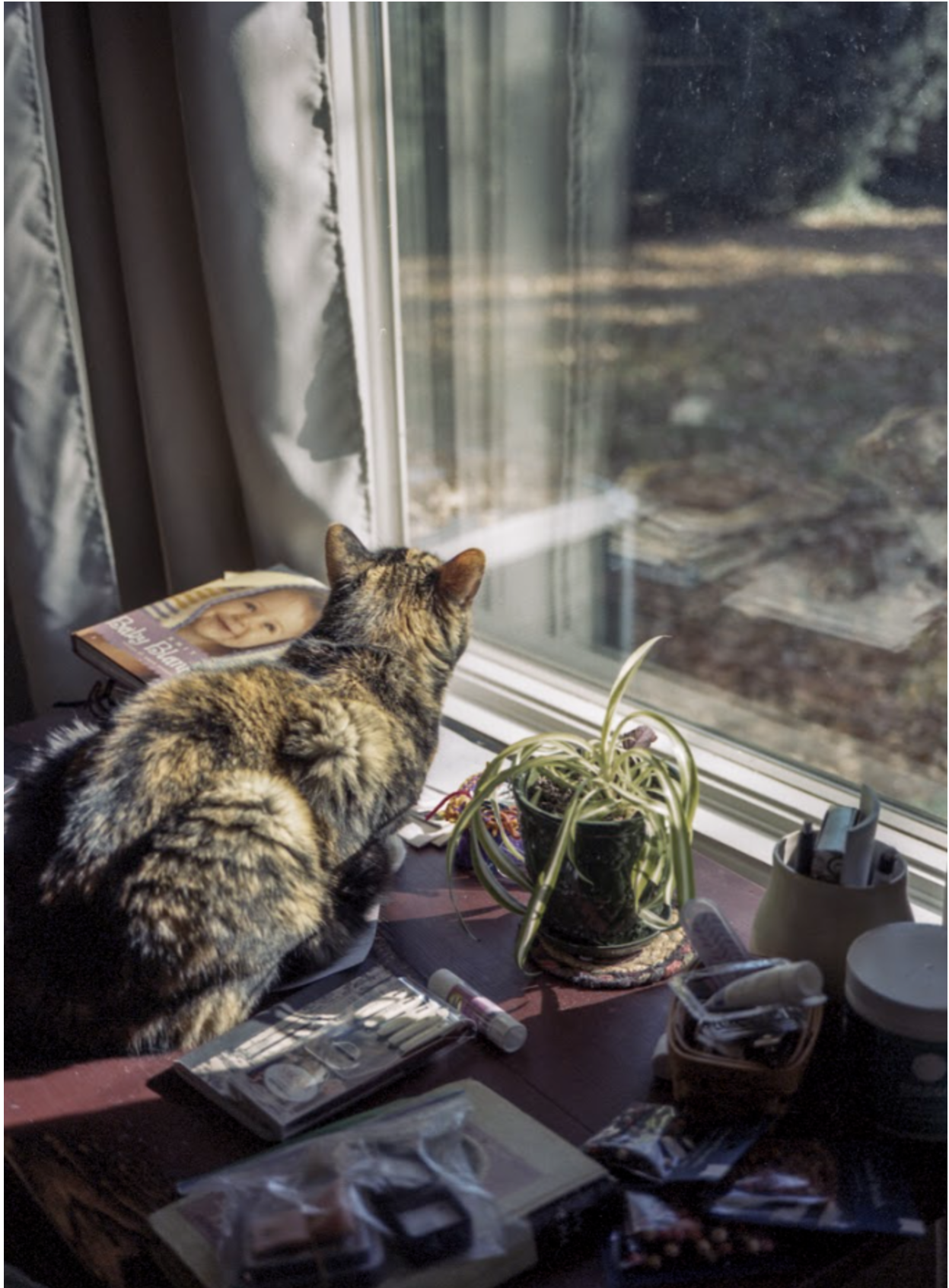
Work by Autumn Woods '27, Photography & Video.