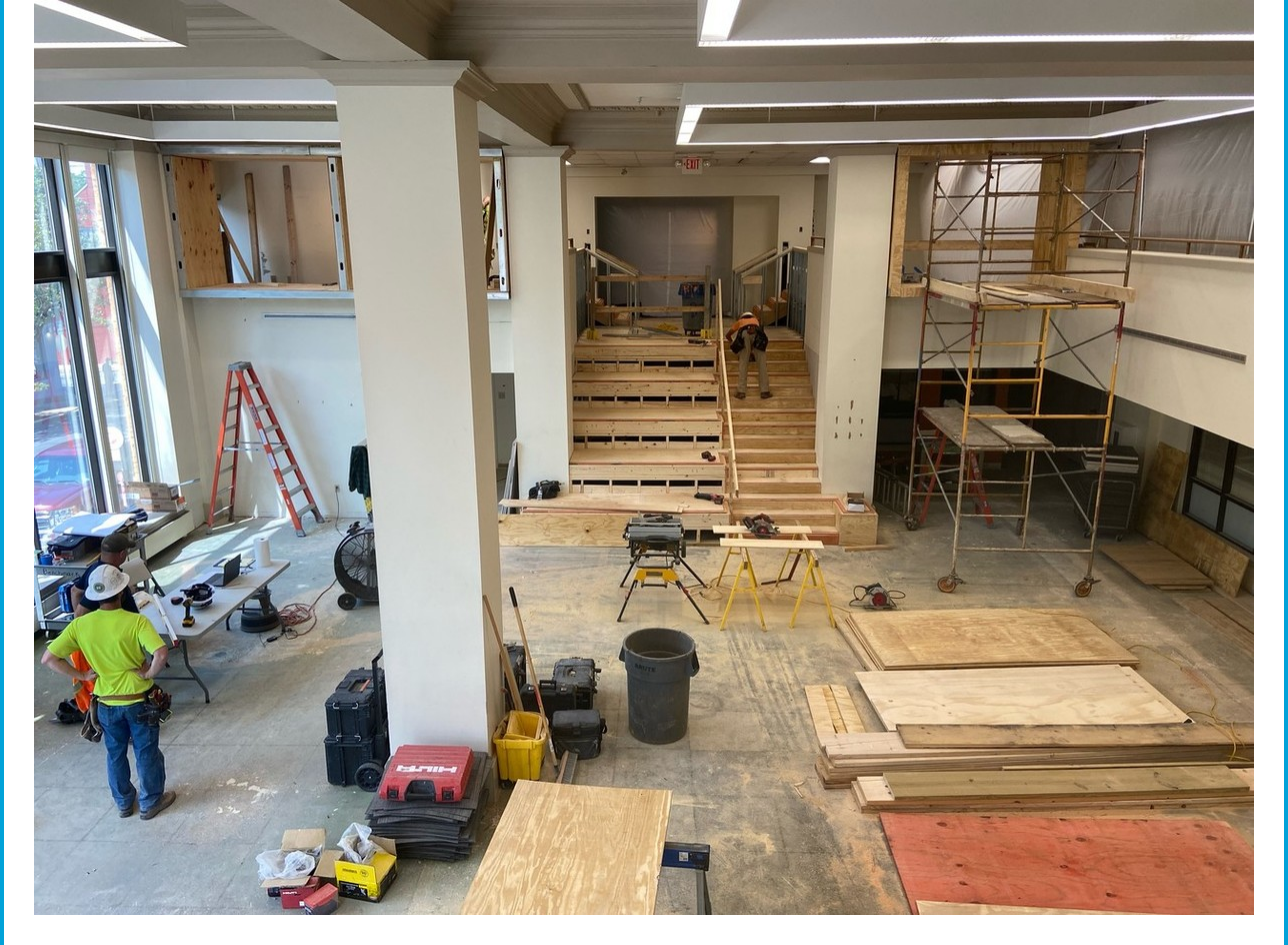
Construction continues in the College Atrium – we're so excited to see the finished renovation when you return in August!